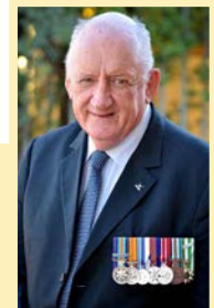
The Hon Tim Fischer AC

Formerly, an Infantry Officer in the 1st Battalion Royal Australian Regiment serving in Vietnam, Member of the NSW Parliament and Deputy Prime Minister serving with the Prime Minister, Hon John Howard MP.